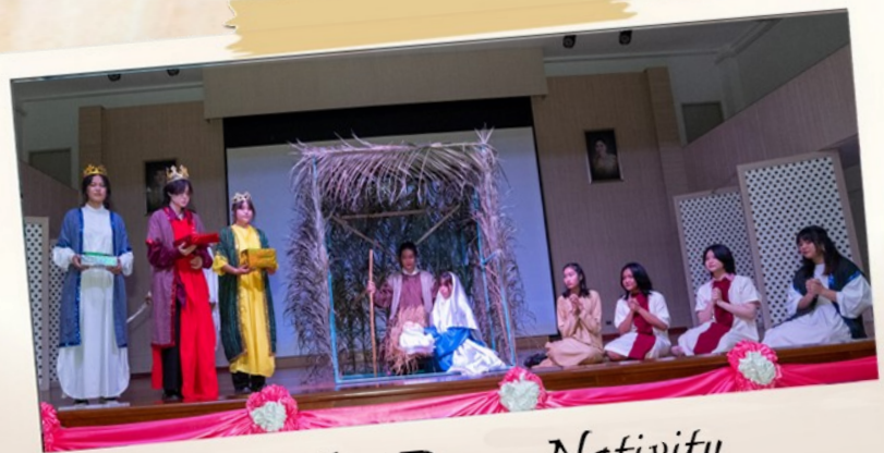
CHIJ Day - Nativity