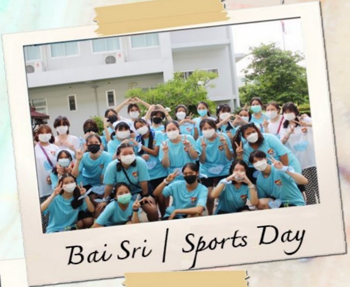
Bai Sri | Sports Day