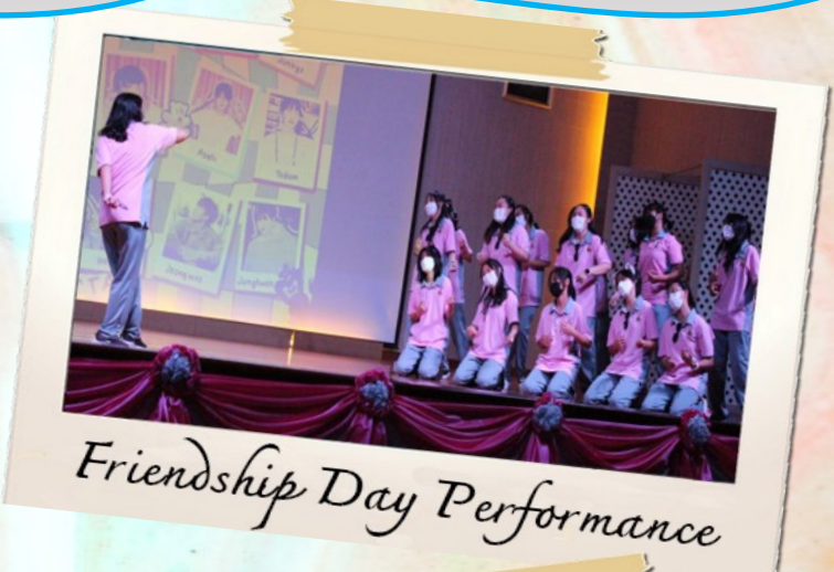
Friendship Day Performance