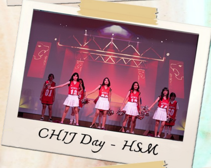
CHIJ Day - H&M