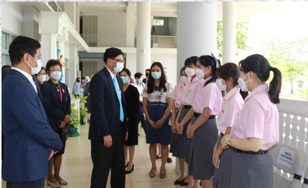
Office of The Private Education Commission officials welcomed by the CHIJ students representatives.

CHIJ, which just celebrated its 59th anniversary in 2022, has reached a new milestone and is more than ready to welcome new challenges as opportunities to grow, learn, and develop. CHIJ would like to express our deepest gratitude to the Office of The Private Education Commission for their guidance and support, and to Pramahatai Suksa School for their collaborative efforts in making this MOU and program possible. The MOU signed by The Convent of the Holy Infant Jesus School (CHIJ) and Pramahatai Suksa School acts as a stepping stone toward equality of educational opportunities, as well as, lifelong learning, which is a form of self-initiated education that is focused on personal development.