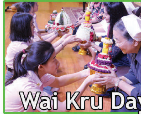
Wai Kru Day