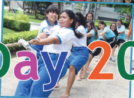
Bai Sri Day 2016