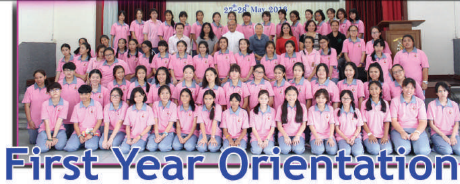
First Year Orientation