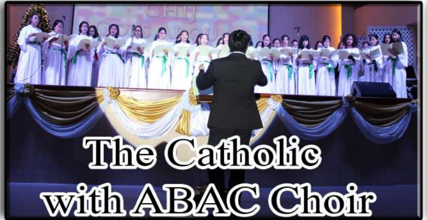
The Catholic with ABAC Choir