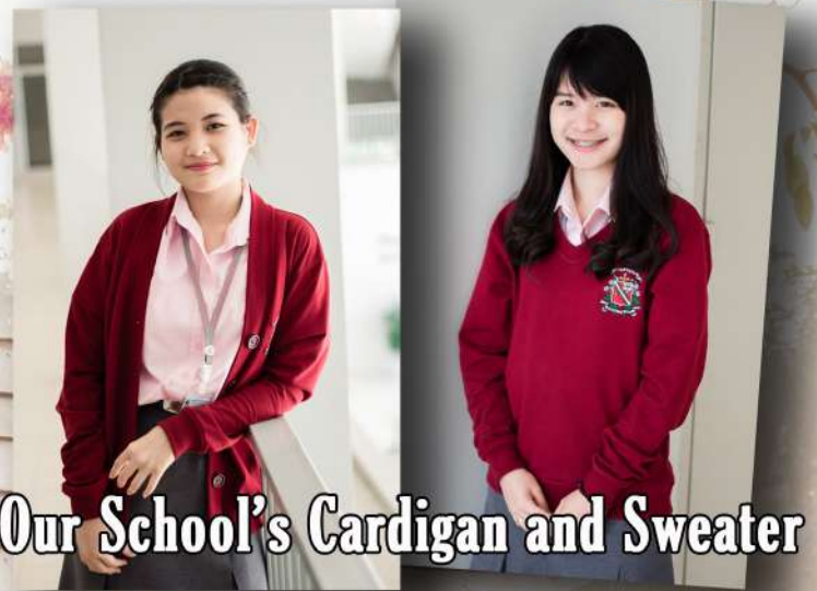
Our School's Cardigan and Sweater