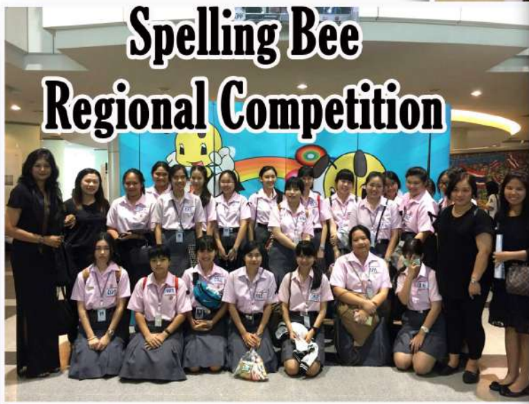
Spelling Bee Regional Competition