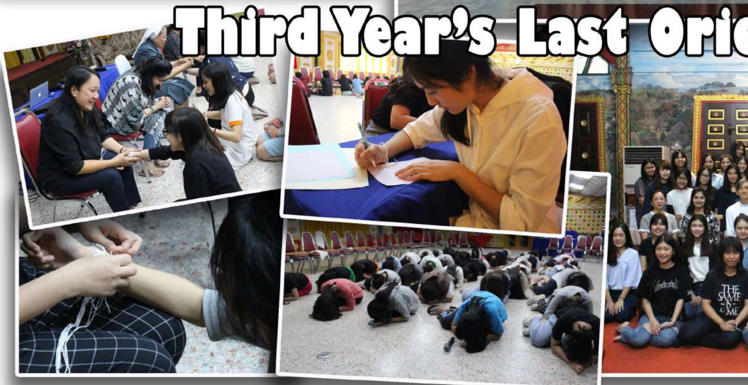
Third Year's Last Ori